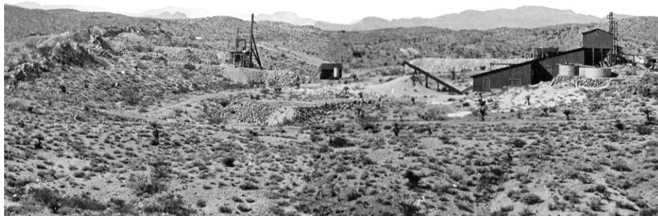
Mill and main shaft of the Leiser Ray mine from the east on January 25, 1917.